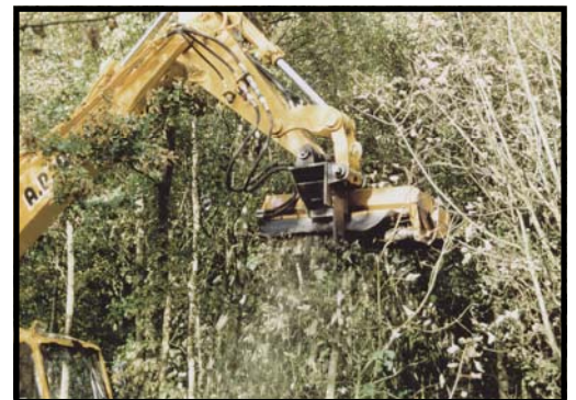
Pictured above, the hedge flail